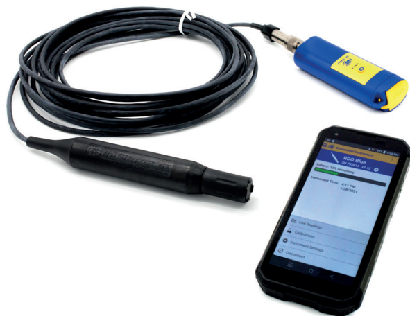
Mobile device not included.