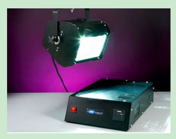
UV 800W Flood Lamp