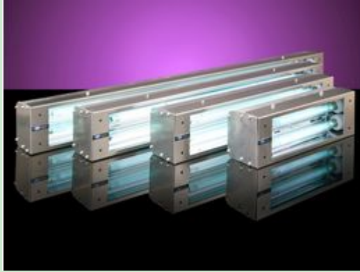
UV 150W High Output Germicidal Tube Unit