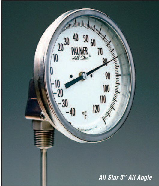
All Star 5" All Angle

NEW! 316SS with IP67 for resistance to harsh outdoor environments